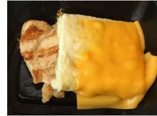
Chic-Fil-A Egg White Grill