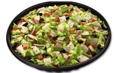
Subway Chopped Salad