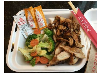
Panda Express Grilled Teriyaki Chicken

PRO TIP: Add extra steamed veggies to any dish, ask for steamed protein options like chicken