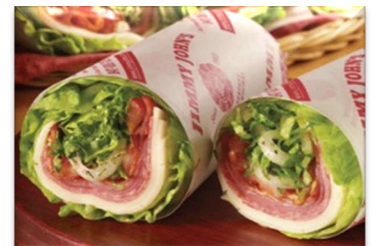
Jimmy Johns Unwich