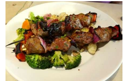
Zoe's Steak Kabob