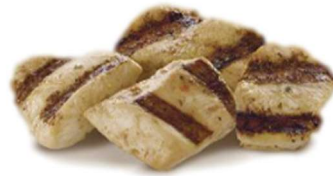
Chic-Fil-A Grilled Nuggets