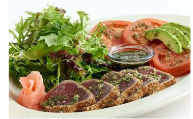
Cheesecake Factory Seared Tuna Tataki Salad