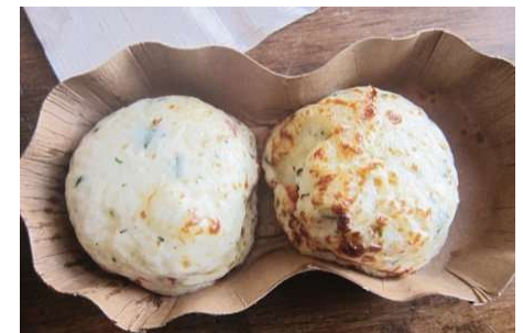
Starbucks Bacon, Egg and Cheese, no bread