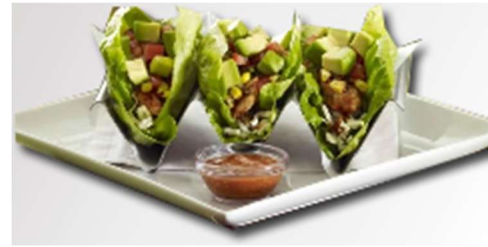
Cheesecake Factory Mexican Chicken Lettuce Wraps