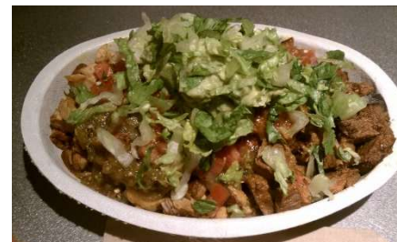
Chipotle Steak Bowl