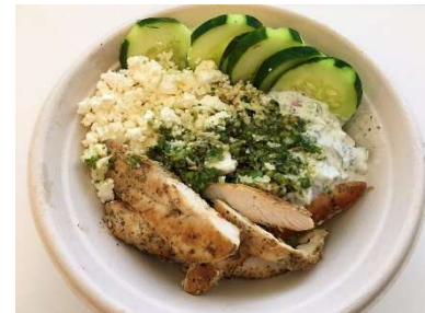
Zoe's Cauliflower Rice Bowl w/ Chicken